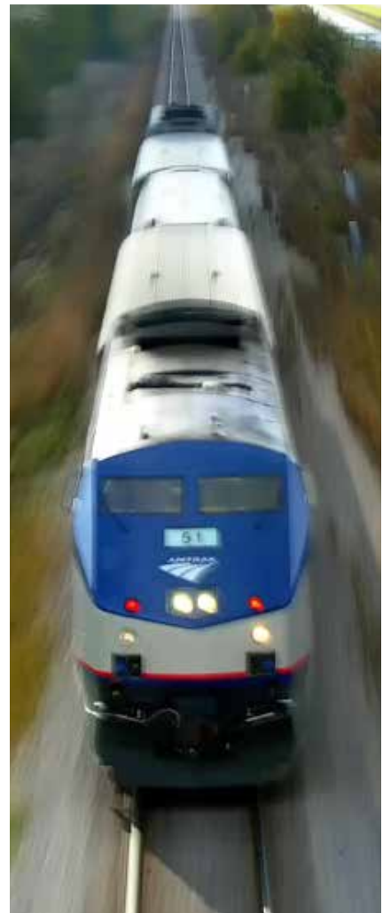
An Amtrak test train, seen from the Hudson Stuckey Road overpass near Towanda, Ill., hit a reported 109 mph on its second test run on Oct. 31, 2002. Steve Smedley

we were inking new agreements with IDOT to implement 110-mph operations on UP's portion of the Chicago-St. Louis line. Just over two years after the NAJPTC project concluded, its train control and crossing aspects were back on my plate and within the PTC statutory mandate. Long-term 110-mph operation ceased to be a stand-alone effort and became fully entangled with overall PTC development.