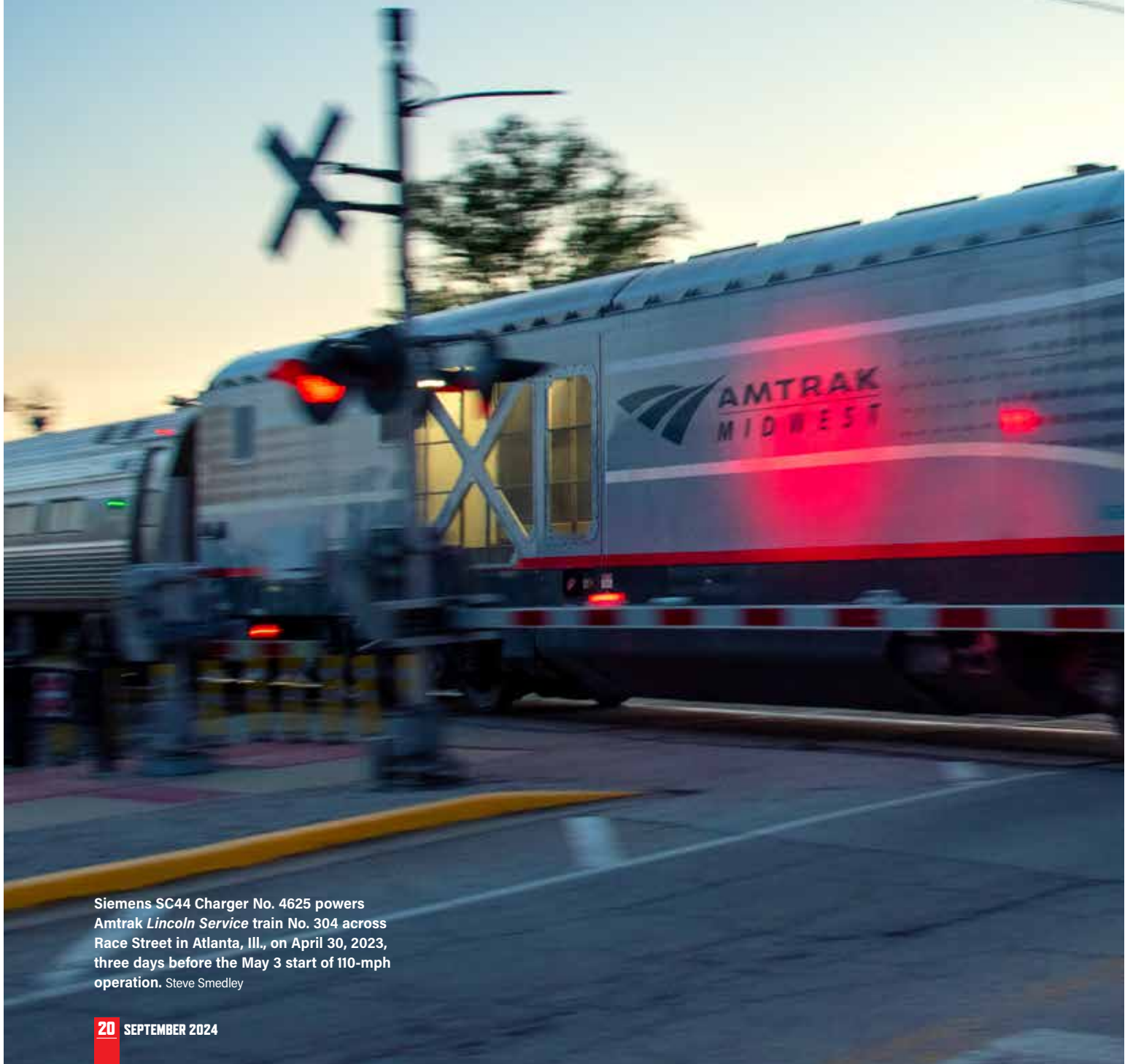
Siemens SC44 Charger No. 4625 powers Amtrak Lincoln Service train No. 304 across Race Street in Atlanta, Ill., on April 30, 2023, three days before the May 3 start of 110-mph operation.