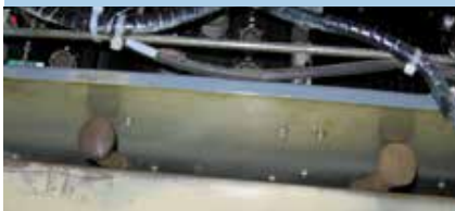
Two spikes inserted below Lockheed Martin's Location Determination System reduced vibration.

Their intrigue turned to surprise and skepticism when they observed two rusty spikes, installed with an air hose wrench, wedged between a bulkhead and the floating end of a cantilevered shelf on which the location determination system enclosure was mounted. That