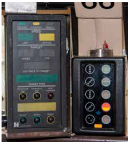
The XITCS display, at left, and UP cab signal display as they were installed in the cab of Amtrak P42 No. 66 during the Dwight-Pontiac 110-mph demonstration. Compare this with the current system shown at right.

One major regulatory hurdle was the requirement that each railroad obtain a PTC System Certification, achieved by FRA's approval of its PTC Safety Plan submission. The FRA could provide certification at several different levels, based on what was requested in and supported by technical material in the railroad's safety plan.