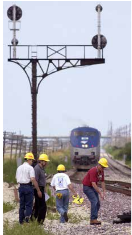
Amtrak and Union Pacific personnel look over a switch at Ballard, Ill., during test runs of equipment involved in the 110-mph program in July 2002.

Another objective was to achieve FRA approval for the new PTC system through a regulatory protocol then under development. Signal and train control regulations, largely codified in Title 49 Part 236 of the Code of Federal Regulations, subparts A through G, were generally prescriptive and written around legacy relay and electro-mechanical systems. They did not apply well to "new and novel" processor-based