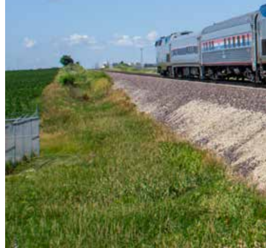
A northbound test train approaches the Airport Road grade crossing north of Springfield, Ill., at 90 mph on June 25, 2020. Technicians in the bungalow are monitoring track circuit and IETMS/XITCS data; flaggers (not visible) protect the crossing. Bob Johnston

the decision to move forward with an interim speed increase from 79 to 90 mph under the existing certification. While not particularly impactful to schedules and operations, it was to be a significant technical milestone, since XITCS would be placed in daily revenue service operation at all crossings and for the first time since the demonstration operation ceased in 2017. Tests were ran at each of the 180-plus equipped crossings, followed by a small number of test-train runs in 2021, all of which were successful. A "soft launch" of 90-mph operation for Lincoln Service and Texas Eagle trains began July 7, 2021. Public schedules were not immediately updated, so trains arriving early at intermediate stations simply dwelled until the existing scheduled departure time. Run-time data was collected and used to develop the new schedules, implemented some weeks later.