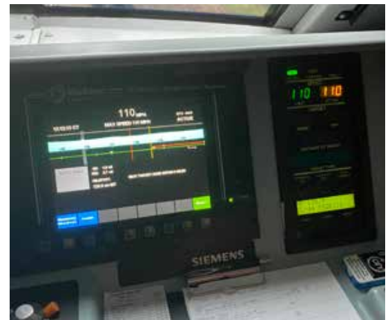
A Siemens Charger shows IETMS positive train control and XITCS displays during current 110-mph operation. XITCS status information is in the gray block at the left center of the PTC screen. Greg Richardson

On the crossing front, UP and Amtrak decided XITCS would remain the technical solution. Crossing-related functions were not mandated by the PTC statute, and it was not feasible to develop them anew as a direct part of the PTC system with the given deadline. The XITCS would operate independent of PTC (although it is able to place some textual status information on the PTC display). Union Pacific installed a new underground fiber-optic cable along the route to support XITCS communications between trains and cross-