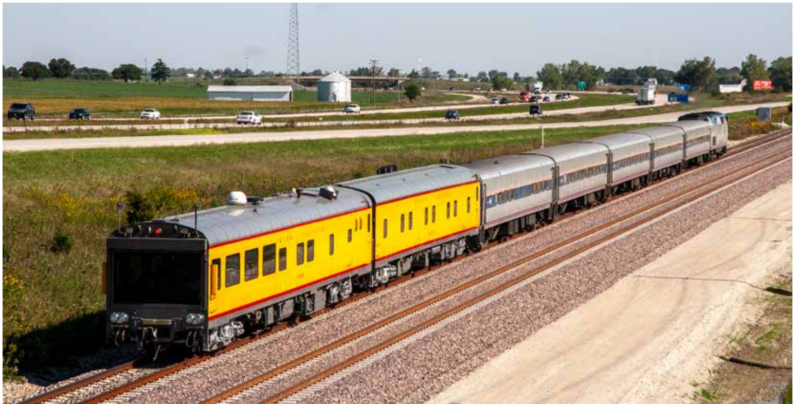
Two Union Pacific business cars trail Lincoln Service train No. 302 near Odell, Ill., on Sept. 15, 2012, as executives view a presentation on the cab signal/XITCS project by the author.