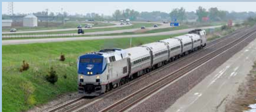
During the period when cab signals allowed 110-mph operation through the area on a demonstration segment, southbound Lincoln Service train No. 301 flies through Odell, Ill., leaving traffic on Interstate 55 in its dust, on May 22, 2014. Bruce Bird

During one afternoon debrief, an engineering consultant presented graphs that indicated that the electrical anomalies appeared to occur at evenly-spaced intervals of 78 to 80 feet on each rail. The number "78" immediately rang a bell — that is the length of rails welded together at the factory to form quarter-mile sections of continuously welded rail. The cause of the signal anomalies was thought to be residual magnetism induced by the factory welding process. At speeds above 90 mph, the cab signal pickup bars encountered the magnetized areas at a rate which interfered with the 180 pulses per minute of the CLEAR cab signal indication. Further tests supported this theory. However, identified solutions were costly and/or impractical. No action was taken, and the problem went away when the demonstration segment's cab signals were retired in 2017. — Greg Richardson